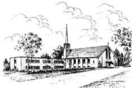
St. Mary's Parish, Shrewsbury, Massachusetts

“Providing The Tools To Build Faith and Knowledge”