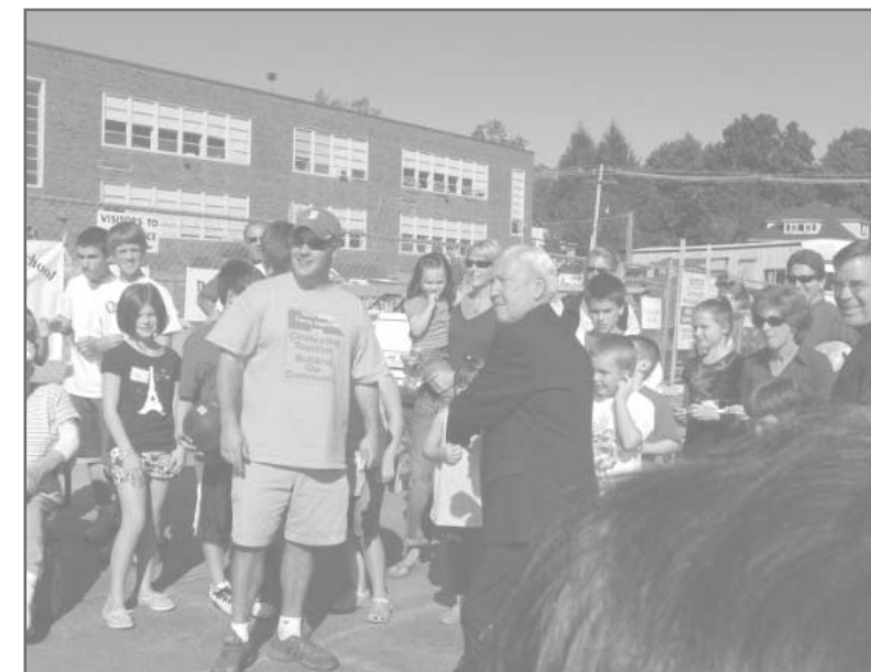
Priests and people celebrate the Family Festival